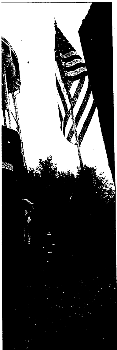
1 comrade during Veterans Day ceremonies Marines at the Portsmouth Naval Shipyard