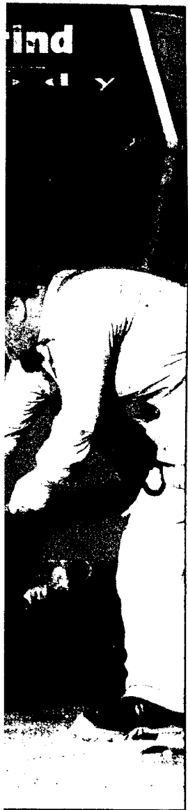
s shut down after a car %. The driver of the car condition. For more on