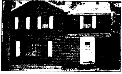
PART OF HOUSE SEALED — A section of this house on Milton Road in Rochester was sealed off by police tape recently as part of an investigation into the death of a toddler. Below is a close- up of the tape on the door.